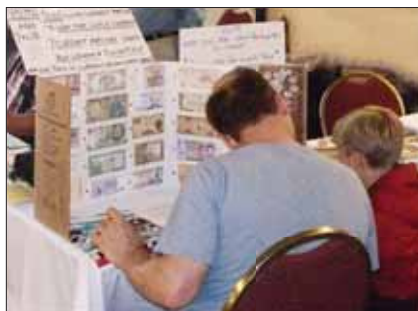
Kids Zone in action with father and son.

During the past five years, the ANA Education Department in conjunction with a core of talented volunteer youth-focused leaders has tirelessly worked toward that end. Some budgeted financial monies along with numerous individual donations were allocated back in 2013 to hosting