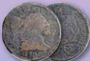
Famous Reeded Edge Cent 1795 S-79, Good 4 EAC