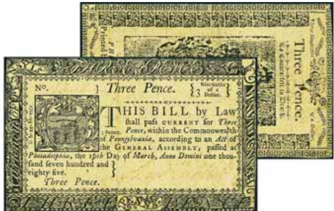
The Three Pence bill from Pennsylvania is also marked as “3 Ninetieths of a Dollar.”

In 1785 the state reverted to British pound denominations, but several had dollar equivalents. The smallest bill was for three pence; it was annotated as “3 Ninetieths of a Dollar” on the face. That makes a dollar equal to seven shillings, six pence. Other bills