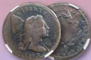
Extremely Rare 1793 S-15 Cent Fine VG10 NGC, Fifth Finest Known