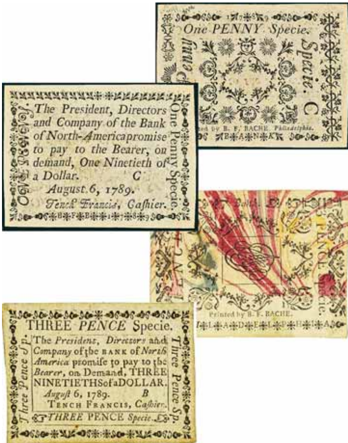
The Bank of North America issued $1/90 and $3/90 bills, worth one and three pence in specie. The latter used Ben Franklin's colorful marbled paper.

1/18, 1/16, 1/15, 1/12, 1/10, 1/9, 1/8, 1/6, 1/5, 2/9, 1/4, 1/3, 2/5, 1/2, 5/8, 2/3, 3/4, and 4/5 of a dollar, not to mention the $1/90 and $3/90 bills. Continental Currency and early states' notes are frequently offered in auctions, coin shows, and coin dealer inventories. Collecting these lowest denominations described above would be a challenging start to building a fascinating and historical collection. They represent the money used by the patriots and public in the everyday business transactions of our fledgling nation.