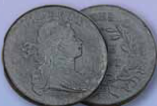
Scarce 1796 S-96 Cent Draped Bust, VG8 EAC