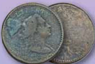
Affordable Starred Reverse Cent 1794 S-48, Fair 2 EAC