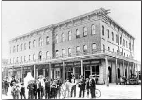
The Occidental in 1892 as a three story brick structure.