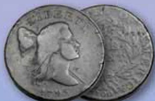
Impressive Jefferson Head Cent 1795 S-80, VG7 EAC