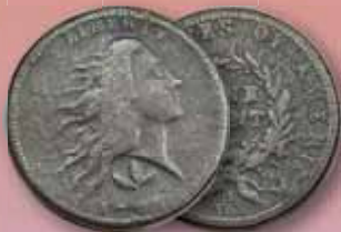
Rare 1793 S-7 Wreath Cent Elusive Variety, VG7 EAC