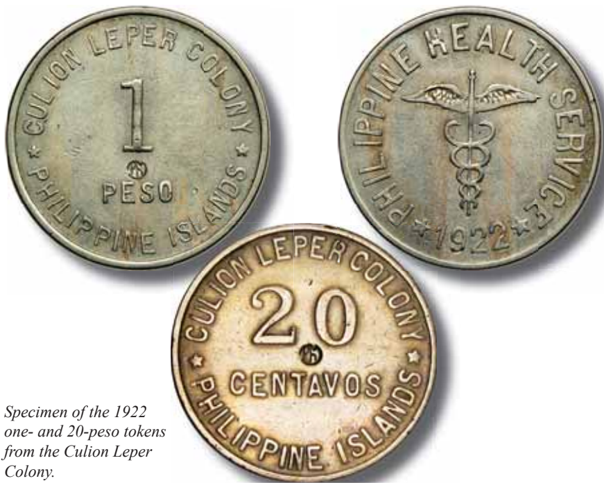
Specimen of the 1922 one- and 20-peso tokens from the Cullion Leper Colony.

pieces) and one peso (8,280 pieces). All of these were struck in copper-nickel (an alloy of 75 percent copper and 25 percent nickel). As Neil Shafer noted in his book United States Territorial Coinage for the Philippine Islands , “The aluminum pieces had been found to deteriorate quite rapidly because of adverse climatic conditions [i.e., high humidity] and it was correctly surmised that copper-nickel would hold up better.” McFadden et al discovered two reverse die varieties in the 20 centavos. Type 1: Displays a normal date. Type 2: Displays a recut date. The authors also identified two die varieties in the one peso. Type 1: On the obverse, the “P” in Peso is positioned over the third “i” in Philippines . On the reverse, the upper