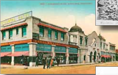
A 1916 postcard showing the Occidental rebuilt as a two story building.

A circa 1950's photo showing the Occidental with the third story added in the 1930's, which restored the hotel to the 150 rooms it had prior to the 1906 quake.