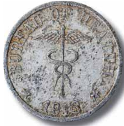
A specimen of the 1913 one peso token from the Culion Leper Colony.

the past, been taken from their leprosy mothers within the first six months of life had become lepers themselves. Because mothers refused to give up their infants, newborns were permitted to stay with their moms during the first six months. At the end of this time the infants were placed in an on-site nursery for two years [Chapman, 1982]. This facility, completed in 1916 and operated under the supervision of the colony's nuns, exercised strict hygiene. "Those [nuns] who worked with patients had to step on a disinfecting solution and change clothes before entering the nursery," Ceres Doyo recalled in a feature article she wrote for the Philippine Daily Inquirer in 2006. Parents viewed these children through glass panels, she stated, but weren't allowed physical contact.