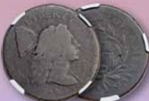
Elusive 1793 S-16 Cent Liberty Cap Rarity, Good Details NGC