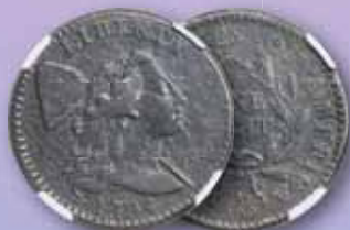
Important 1794 S-37 Cent Ex: Exman Collection, VF Details NGC