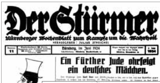
Left/below: the masthead of the anti-Semitic German newspaper, Der Stürmer, and the article it contained critical of the medal.