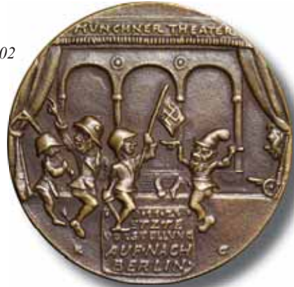
Above: the Karl Goetz medal referenced as Kienast-302.