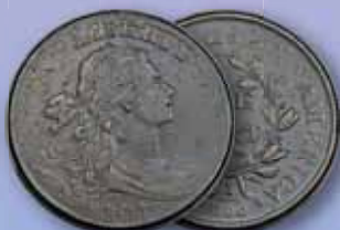
Popular 1801 S-217 Cent Condition Census, VF20 EAC