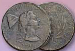
Census Level 1794 Head of 1793 Cent S-18a VG10 EAC, Fourth Finest