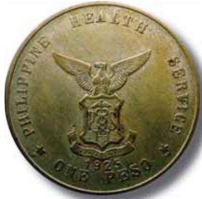
A specimen of the 1925 one peso token from the Culion Leper Colony.

ment, only the Philippine currency could be used. (2) In the leper colony proper, the legal currency was the leper money, made for the exclusive use of Culion patients. (3) All non-lepers who had any of the special currency in their possession were expected to exchange it for Philippine currency at Colony Hall. (4) All patients who had any of the Philippine currency in their possession were instructed to exchange it for leper money at the Culion general store. (5) All exchanges were made at par value. (6) The use of Philippine currency inside the colony was not permitted. (7) Any non-leper vendor who desired to sell merchandise to patients was required to obtain a permit. It stated that the vendor agreed to comply with all currency regulations established by the government. (8) Patients were required to pay for all such transactions in leper money, deposited in advance with the disbursing officer at the colony's gate. The officer, in turn, issued a receipt for the amount received. This was then