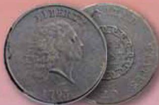
Attractive 1793 Chain Cent With Periods, S-4, VF25 PCGS