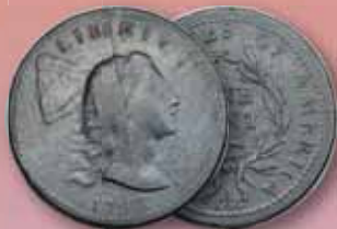
Famous Bisecting Crack Cent 1793 Liberty Cap S-14, VG10 EAC